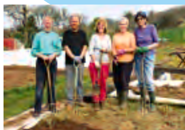
Below: St Erth allotments