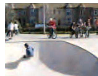
Above: Hayle Skate Park